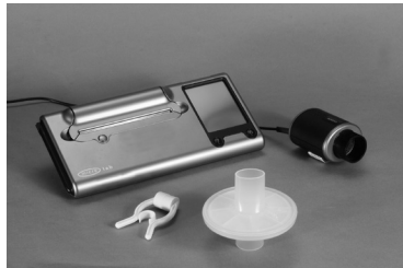
Spirometry mouthpiece & nose peg

This test gives us information about how open your airways are, and the size of your lungs. First, we will ask you to breathe in fully and to blow out in a relaxed way, into a mouthpiece, for as long as you possibly can. This will be done sitting down with a nose peg on. We will then ask you to breathe in fully and to blow out as hard and as fast as possible into a mouthpiece on the lung function equipment, until you are completely empty. We will ask you to do each test a number of times to get accurate results.